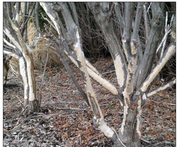
Burning bush ( Euonymus alatus ) showing extensive chewing damage from rodents.

WHAT: Bridge Grafting WHEN: April 8, 7 p.m.–9 p.m. WHERE: HLG Auditorium COST: Open to the public; regular HLG admission rates apply